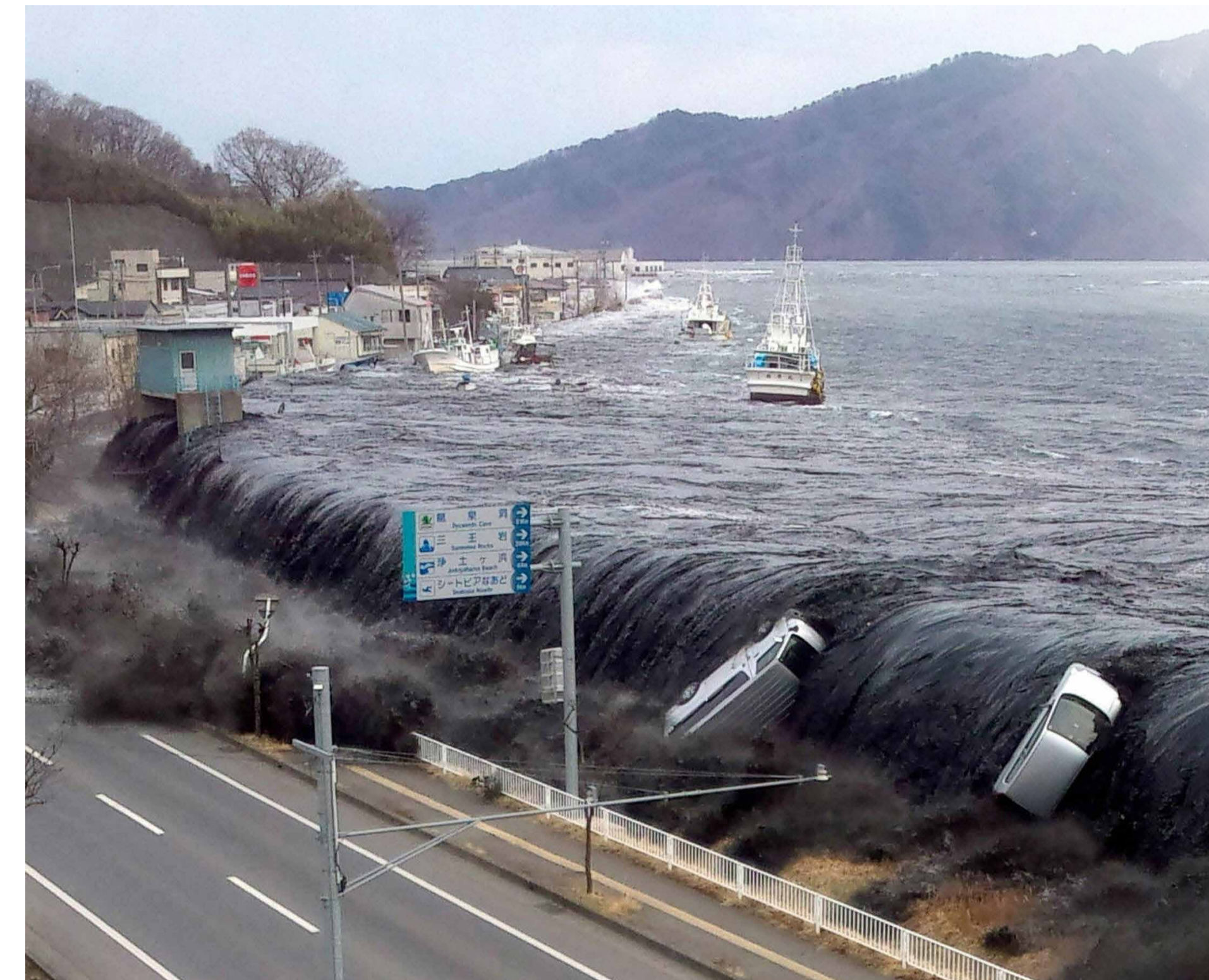
Fig 1. Unforeseen external incidents, such as the earthquake and tsunami in Japan 2011, remind us of how vulnerable today's supply chains can be.

The third part covers our supply chain sustainability, comprising rigid standards for supplier qualification and management.